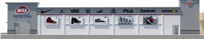
PROPOSED SOUTH ELEVATION FACING SHERMAN WAY