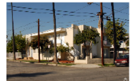
Thomas Bros. Guide 595-F6