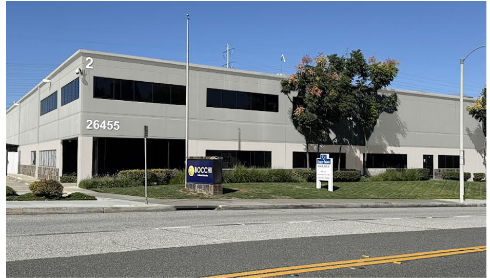
Photo colors are simulations and can vary depending upon the light, shadows and angle of the original photograph.

LOADING ONE (1) 12'X12' GROUND LEVEL DOOR SIX (6) 10'X10' DOCK HIGH DOORS