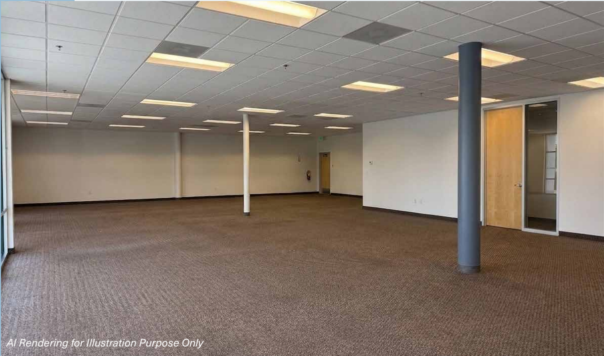
AI Rendering for Illustration Purpose Only