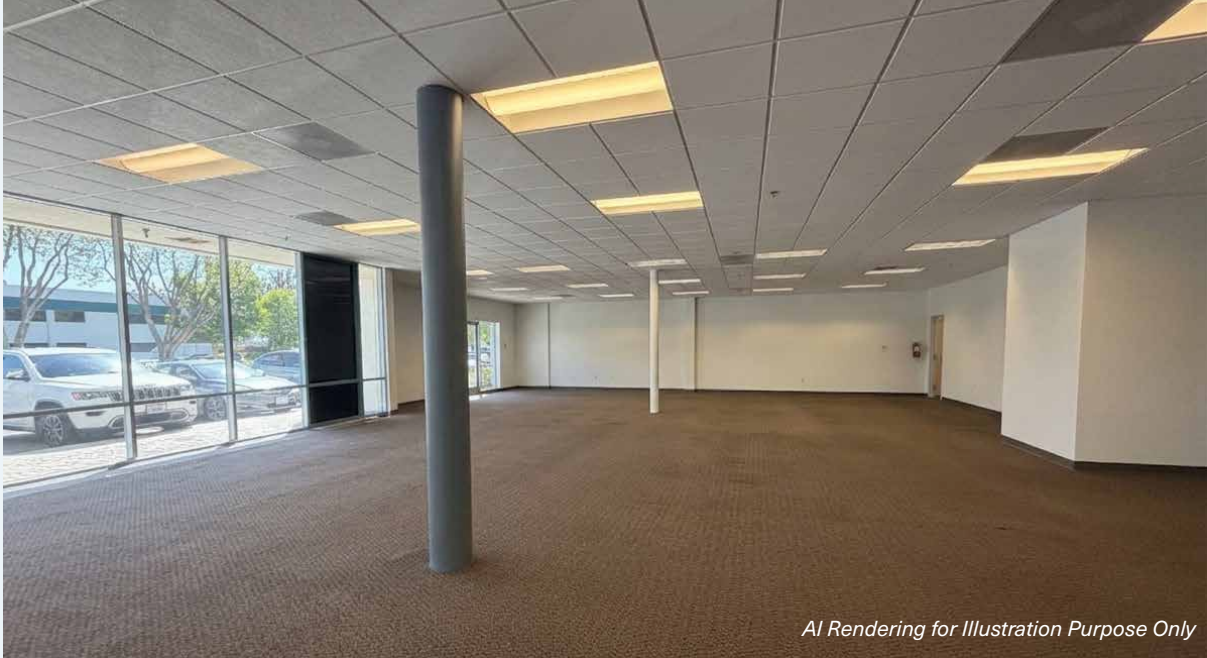
AI Rendering for Illustration Purpose Only