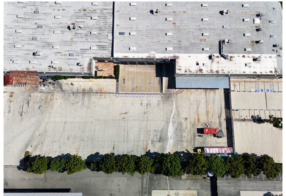
3 26455 RUETHER AVE SANTA CLARITA CA 91350