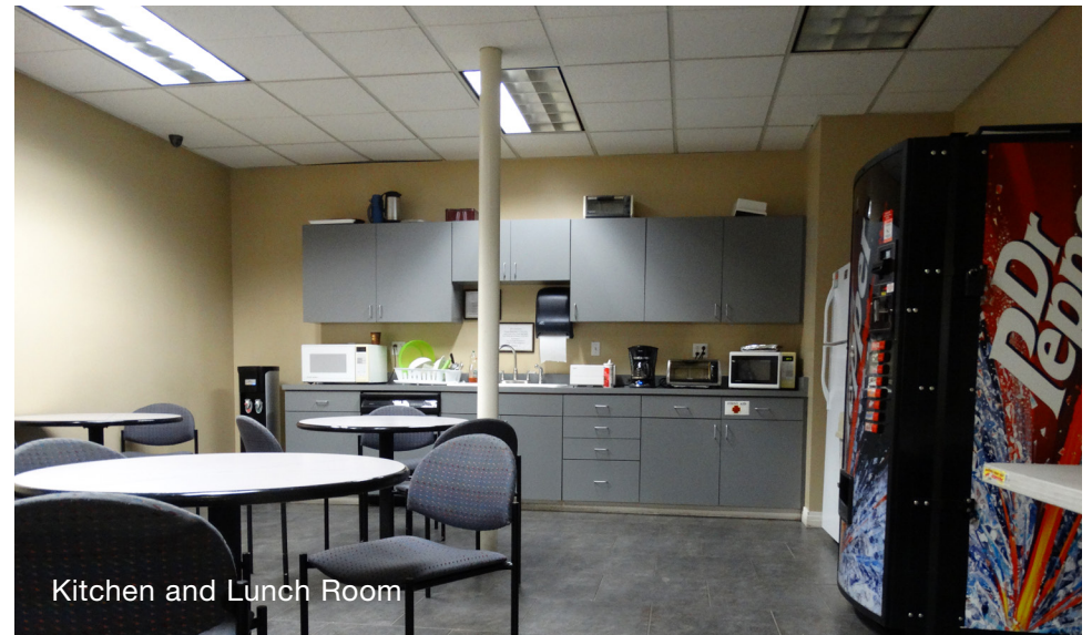
Kitchen and Lunch Room