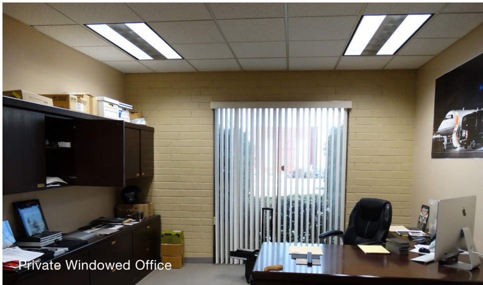
Private Windowed Office