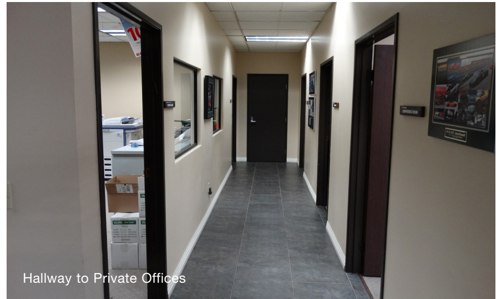
Hallway to Private Offices